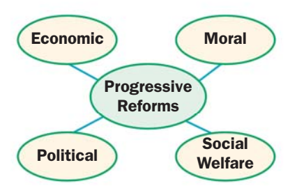
Which group was most successful and why?

Copy the web below on your paper. Fill it in with examples of organizations that worked for reform in the areas named.