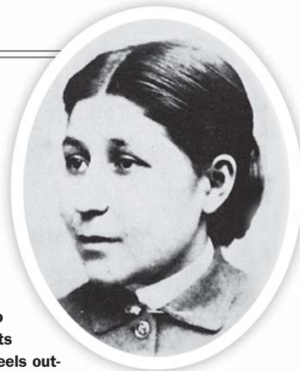
▲ Susette La Flesche

La Flesche testified before congressional committees and helped win passage of the Dawes Act of 1887, which allowed individual Native Americans to claim reservation land and citizenship rights. Her activism was an example of a new role for American women, who were expanding their participation in public life.