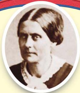
SUSAN B. ANTHONY 1820–1906