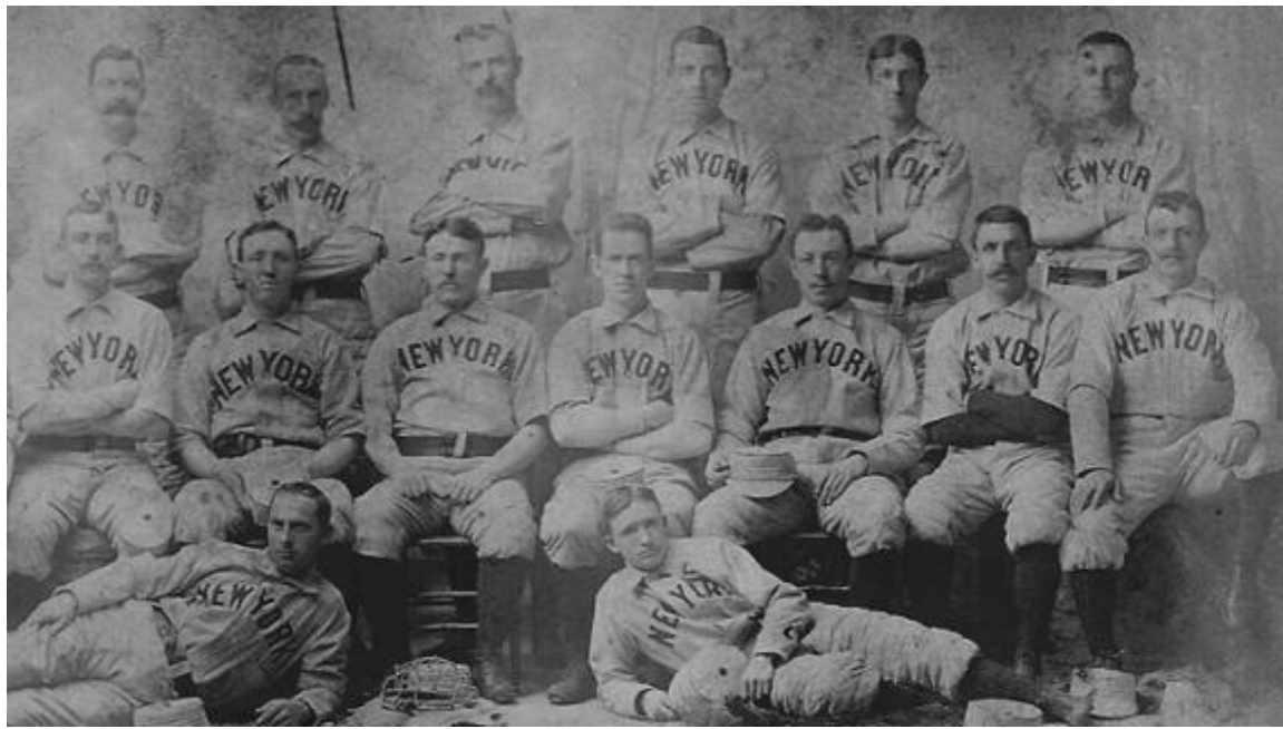
Doc. 4. Source: Photograph c. 1883 - The New York Gothams Baseball Club, "The Gotham Club."