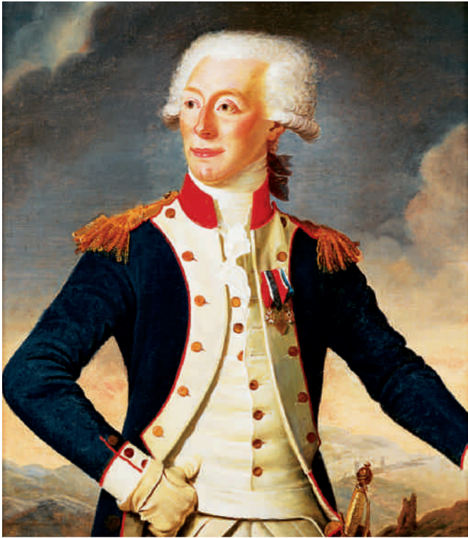
Gilbert du Motier, Marquis de Lafayette (1757–1834), by Joseph Boze, 1790 This youthful French officer gave to America not only military service but some $200,000 of his private funds. He returned to France after the American Revolution to play a conspicuous role in the French Revolution.

Even the Continental Congress, which directed the conflict, was hardly more than a debating society, and it grew feebler as the struggle dragged on. “Their Congress now is quite disjoint’d,” giped an English satirist, “Since Gibbits (gallows) [are] for them appointed.” The disorganized colonists fought almost the entire war before adopting a written constitution—the Articles of Confederation—in 1781.