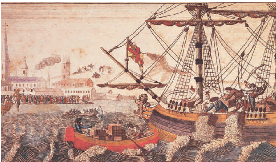
The Boston Tea Party, December 16, 1773 Crying “Boston harbor a teapot this night,” Sons of Liberty disguised as Indians hurled chests of tea into the sea to protest the tax on tea and to make sure that its cheap price did not prove an “invincible temptation” to the people.

On December 16, 1773, roughly a hundred Bostonians, loosely disguised as Indians, boarded the docked ships, smashed open 342 chests of tea, and dumped their contents into the Atlantic, an action that came to be known as the Boston Tea Party . A crowd of several hundred watched approvingly from the shore as Boston harbor became a vast teapot. Donning Indian disguise provided protesters with a threatening image—and a convenient way of avoiding detection.