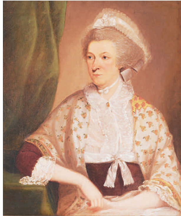
Fenimore Art Museum, Cooperstown, New York

Samuel Adams (1722–1803) A second cousin of John Adams, he contributed a potent pen and tongue to the American Revolution as a political agitator and organizer of rebellion. He was the leading spirit in hosting the Boston Tea Party. A failure in the brewing business, he was sent by Massachusetts to the First Continental Congress of 1774. He signed the Declaration of Independence and served in Congress until 1781.