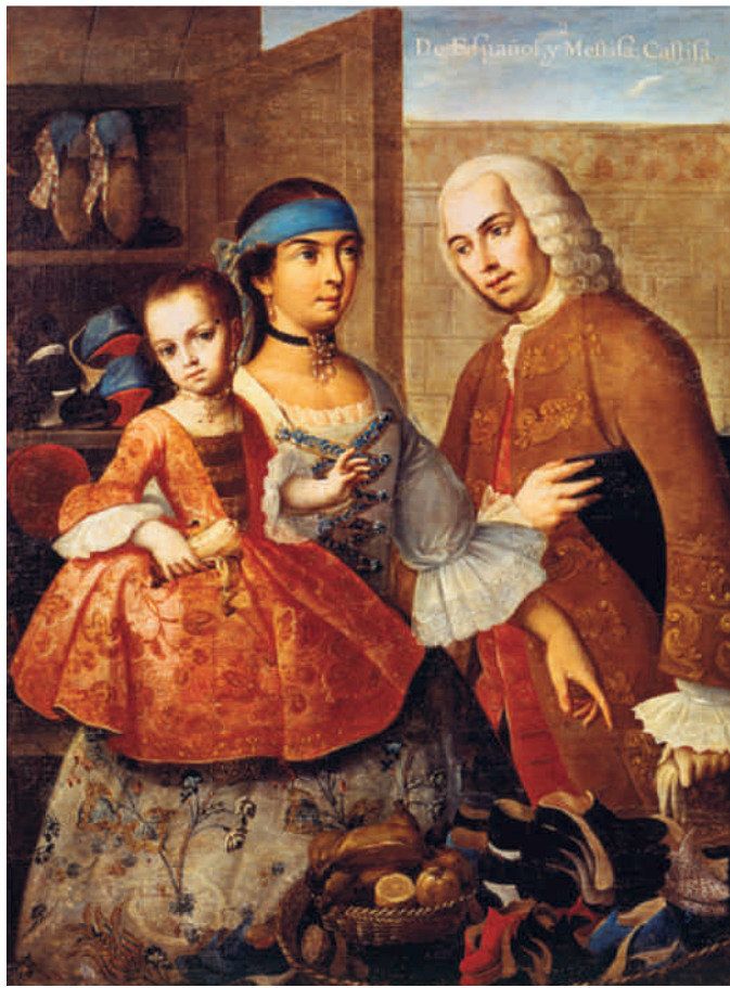
Couple with Child by Miguel Cabera This eighteenth-century portrait of a Mexican family illustrates the common intermarriage of Europeans and Indians in the Spanish New World. The ethnic complexity of Spanish America kept colonists there from uniting against imperial authorities as successfully as their northern neighbors.

reasonable but in tune with Enlightenment ideas about efficient administration. To colonial subjects these new policies were an anathema, a flagrant offense to their fundamental rights as colonial subjects.