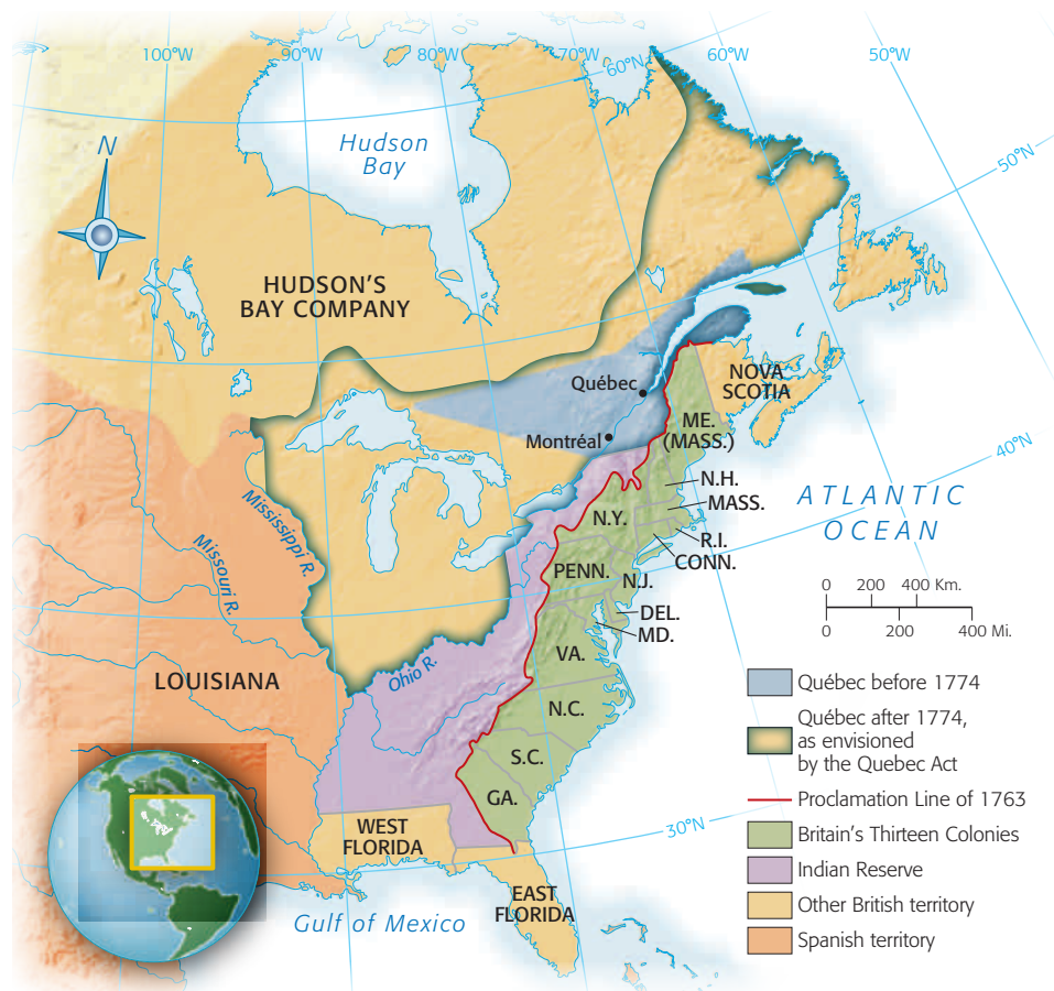
MAP 7.1 Québec Before and After 1774 Young Alexander Hamilton voiced the fears of many colonists when he warned that the Quebec Act of 1774 would introduce “priestly tyranny” into Canada, making that country another Spain or Portugal. “Does not your blood run cold,” he asked, “to think that an English Parliament should pass an act for the establishment of arbitrary power and Popery in such a country?”

Congress in 1774. It was to meet in Philadelphia to consider ways of redressing colonial grievances. Twelve of the thirteen colonies, with Georgia alone missing, sent fifty-five well-respected men, among them Samuel Adams, John Adams, George Washington, and Patrick Henry. Intercolonial frictions were partially melted away by social activity after working hours; in fifty-four days George Washington dined at his own lodgings only nine times.