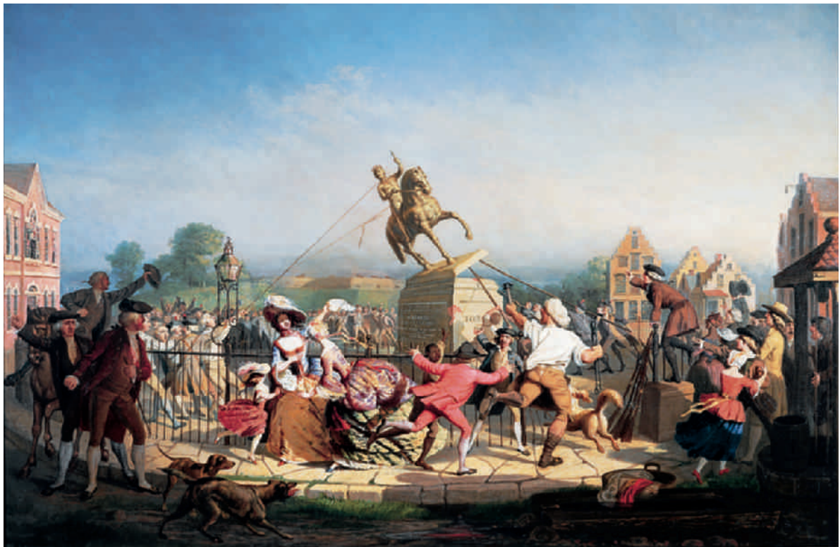
New York Patriots Pull Down the Statue of King George III Erected after the repeal of the Stamp Act in 1766, this statue was melted down by the revolutionaries into bullets to be used against the king’s troops.

About eighty thousand loyal supporters of George III were driven out or fled, but several hundred thousand