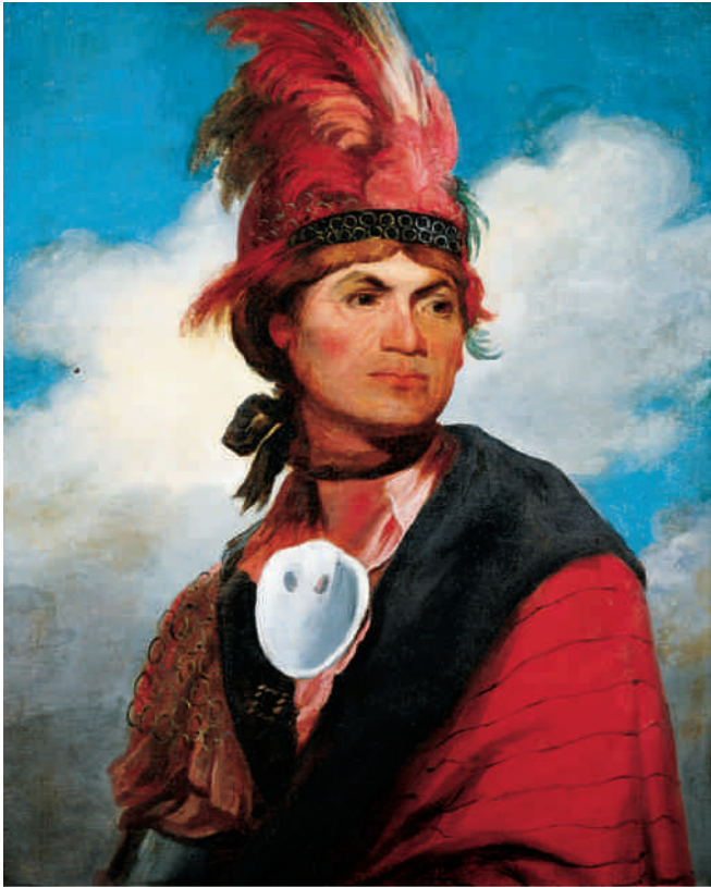
Fenimore Art Museum, Cooperstown, New York

Joseph Brant, by Gilbert Stuart, 1786 Siding with the British, this Mohawk chief led Indian frontier raids so ferocious that he was dubbed “monster Brant.” When he later met King George III, he declined to kiss the king’s hand but asked instead to kiss the hand of the queen.