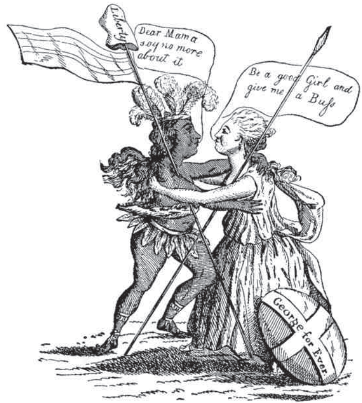
The Reconciliation Between Britannia and Her Daughter America (detail) America (represented by an Indian) is invited to buss (kiss) her mother. Compare this cartoon with the one on p. 114.

In spirit, the Americans made a separate peace—contrary to the French alliance. In fact, they did not. The Paris Foreign Office formally approved the terms of peace, though disturbed by the lone-wolf course of its American ally. France was immensely relieved by the prospect of bringing the costly conflict to an end and of freeing itself from its embarrassing promises to the Spanish crown.