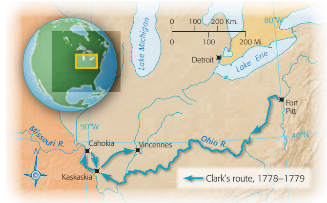
MAP 8.3 George Rogers Clark’s Campaign, 1778–1779

America’s infant navy had meanwhile been laying the foundations of a brilliant tradition. The naval establishment consisted of only a handful of nondescript