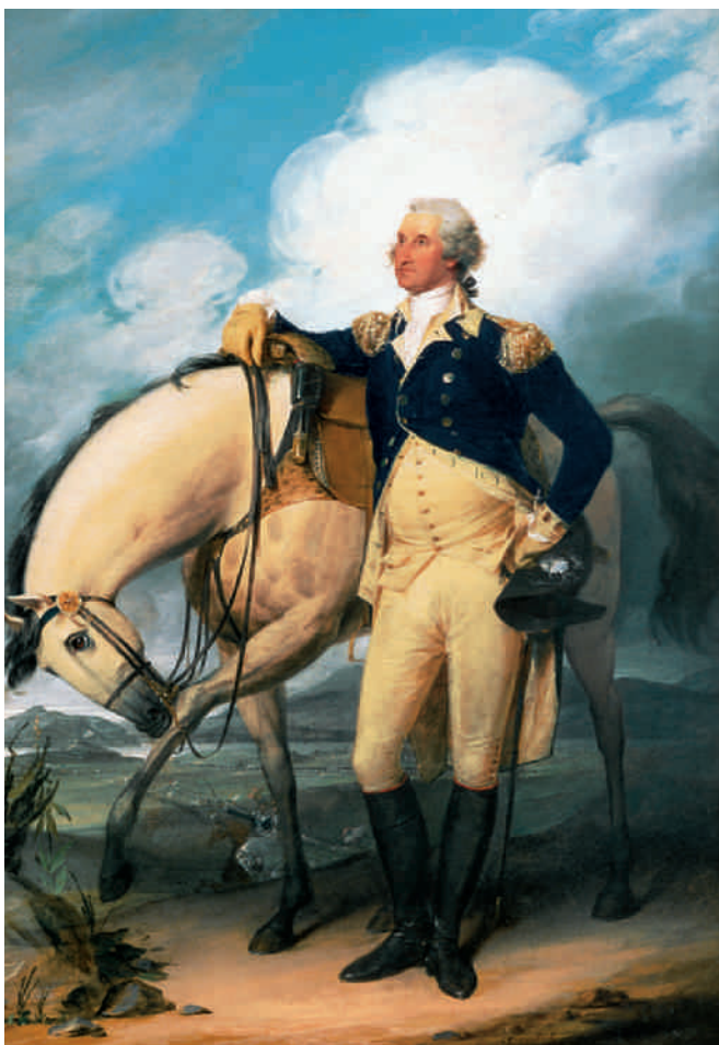
Washington at Verplanck's Point, New York, 1782, Reviewing the French Troops After the Victory at Yorktown, by John Trumbull, 1790 This noted American artist accentuated Washington's already imposing height (six feet two inches) by showing him towering over his horse. Washington so appreciated this portrait of himself that he hung it in the dining room of his home at Mount Vernon, Virginia.