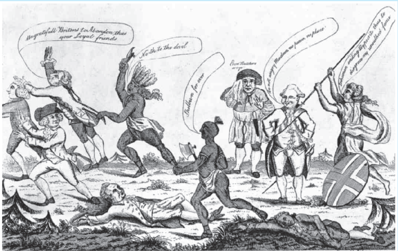
Loyalists Through British Eyes This British cartoon depicts the Loyalists as doubly victimized—by Americans caricatured as “savage” Indians and by the British prime minister, the Earl of Shelburne, for offering little protection to Britain’s defenders.

boarded ships from British-controlled ports expecting to embark for freedom instead found themselves sold back into slavery in the West Indies.