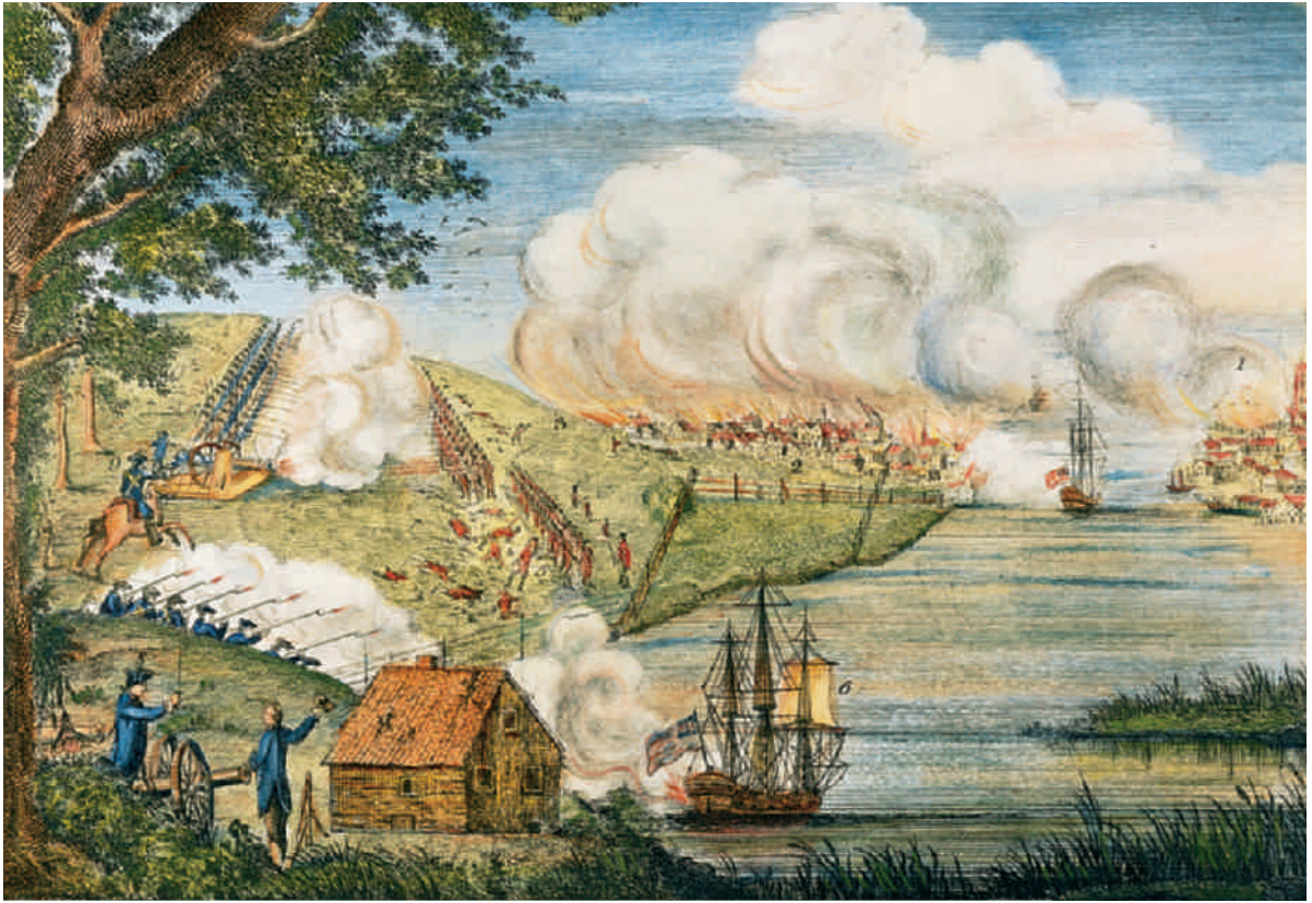
Battle of Bunker Hill, June 17, 1775 This British engraving conveys the vulnerability of the British regulars to attacks by the American militiamen. Although a defeat for the colonists, the battle quickly proved a moral victory for the Patriots. Outnumbered and outgunned, they held their own against the British and suffered many fewer casualties.

in revolt. But this large-scale attack, involving some two thousand American troops, contradicted the claim of the colonists that they were merely fighting defensively for a redress of grievances. Invasion northward was undisguised offensive warfare.